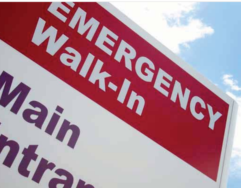
Our expanded emergency room will feature a number of amenities including a dedicated ER entrance.

This award recognizes MountainView's commitment and success in implementing a higher standard of stroke care by ensuring that patients receive treatment according to nationally accepted standards and recommendations set forth by the American Stroke Association.